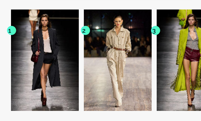
Gucci S24 001